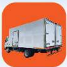
20 Footer /6.10m