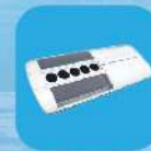
KRS II PLUS