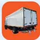
24 Footer /7.32m