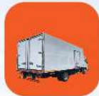
14 Footer /4.27m