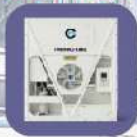
Container Fresh & Frozen (CFF)