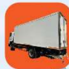
26 Footer /7.9m