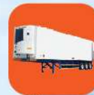
40 Footer /12.20m