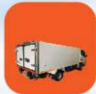
10 Footer /3.08m