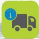
Fuel Reading & Extensive Report