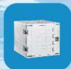
ColdCube 330 L