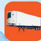
45 Footer /13.73m