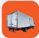
16 Footer /4.88m