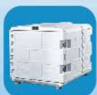
ColdCube 915 L