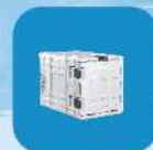
ColdCube 140 L