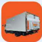
22 Footer /6.71m