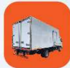
18 Footer /5.49m