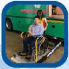
Wheel Chair Lifter