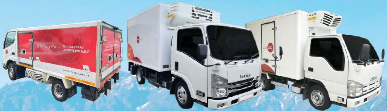
Cabin Height 10 Footer