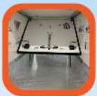
Internal Movable Partition