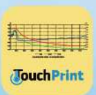
Touch Print Datalogger