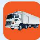
32 Footer /9.76m