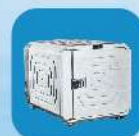
ColdCube 720 L