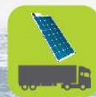
Thermolite™ Solar Panel