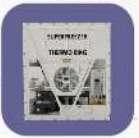
SUPERFREEZER (-70°C) GDP Compliant