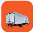
12 Footer /3.66m